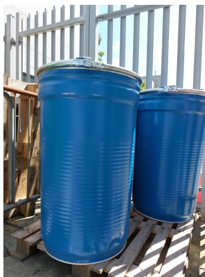
Blue chemical waste drums.