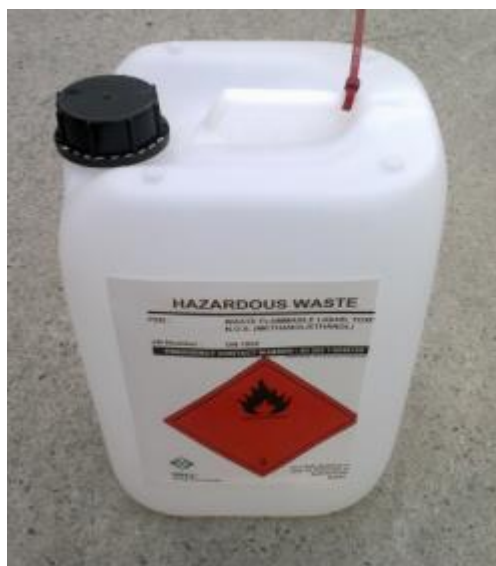
Non-halogenated solvent waste container