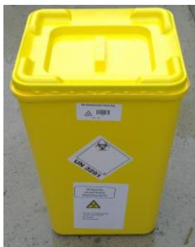
Potentially infectious (rigid) laboratory waste bin