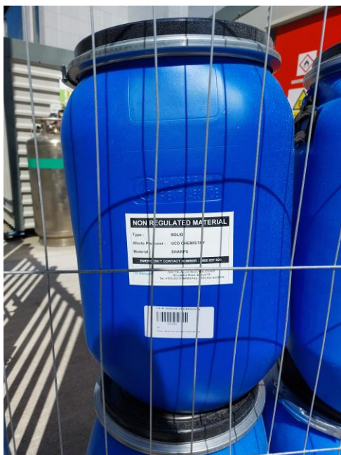
Chemically contaminated glass and sharps bin