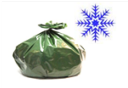
Recognizable animal tissue waste bag