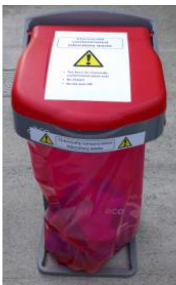
Chemically contaminated laboratory waste bin.