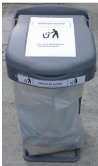
General waste bin