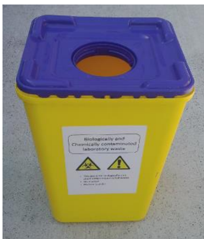
Potentially infectious laboratory waste contaminated with chemicals bin