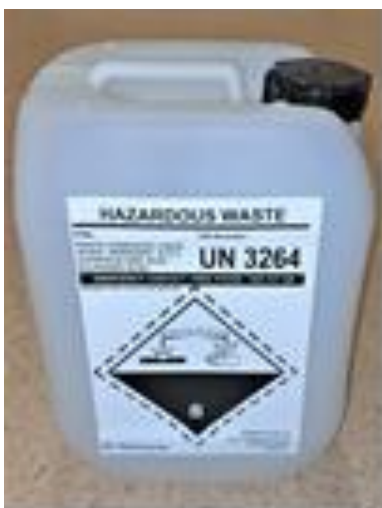
Corrosive waste container