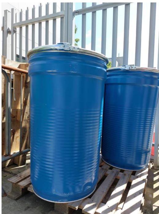
Blue chemical waste drums