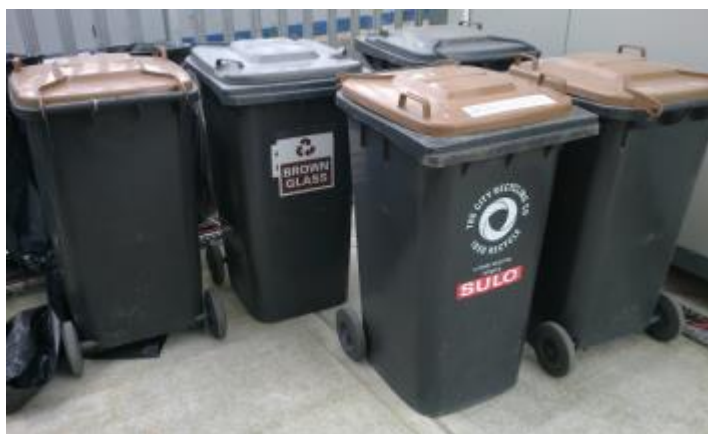
Brown glass wheelie bins