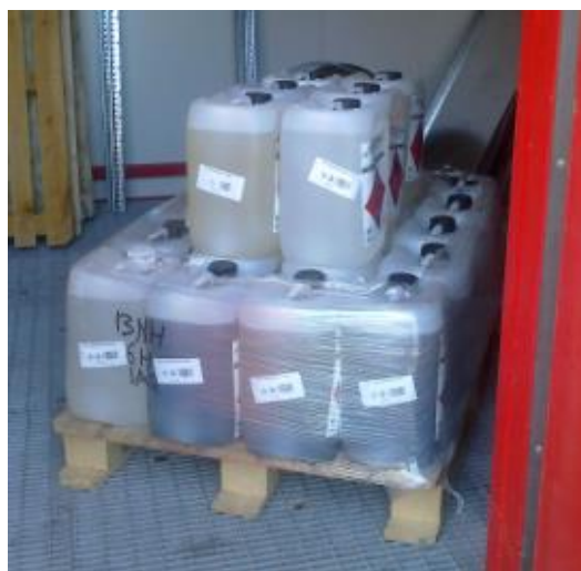
Containers stacked on pallet in fire rated container