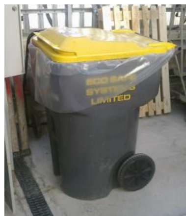
Grey wheelie bin