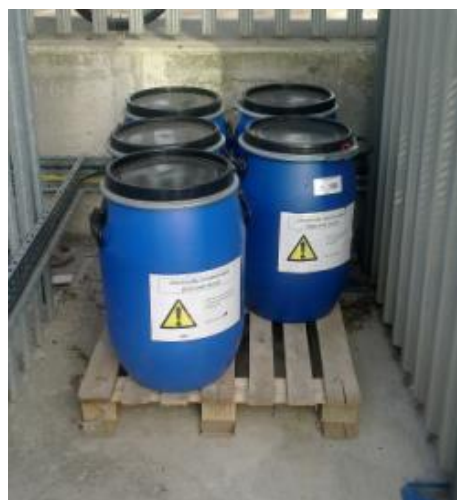
Pallet for glass and sharps bins