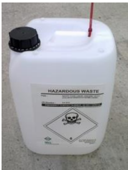
Halogenated solvent waste container