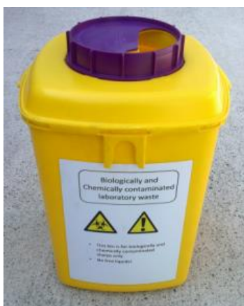
Potentially infectious laboratory sharps contaminated with chemicals bin