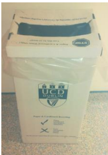
Paper and cardboard recycling bin