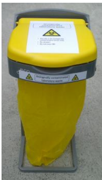
Potentially infectious waste bag