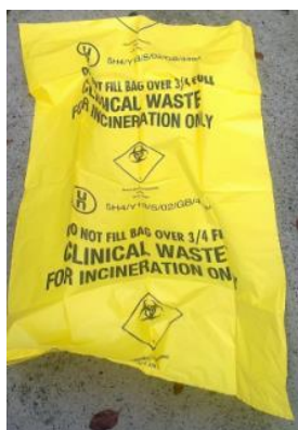
UN approved bag