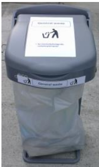
General waste bin